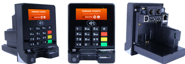
The Self/4000 is supported by our Cloud Services